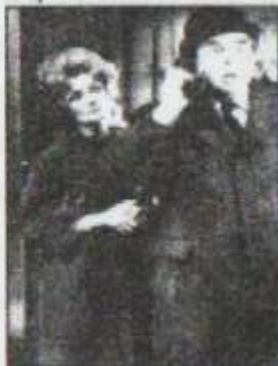
Frank (Robert Morley) with Fiona (Joan Tetzel) in the original London Production at the Lyric Theatre 5th August 1970

More than 30 have subsequently been produced in the West End, at the Royal National Theatre or the RSC since his first hit, Relatively Speaking , opened at the Duke Of York's Theatre in 1967. Sir Alan Ayckbourn received a knighthood in 1997, the first living playwright to be knighted since Noel Coward in 1970. He is the world's most frequently performed playwright after Shakespeare