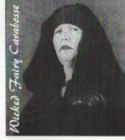
Wicked Fairy Carabosse