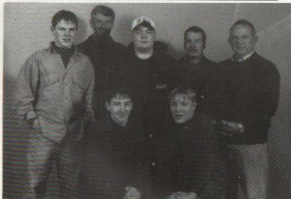
THE BACKSTAGE CREW