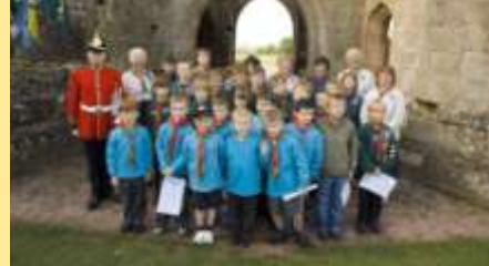
Centenary Celebration at Raglan Castle 1st August 2007.

Beavers 6 —8 years, Cub Scouts 8 —10 1/2 years. Scouts 10 —14 years. Explorer Scouts 14 —18 years. Network 18 —25 years. Leaders 18 +.