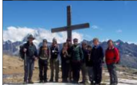
High level hiking in Switzerland 2008

Beavers 6 —8 years, Cub Scouts 8 —10 1/2 years. Scouts 10 —14 years. Explorer Scouts 14 —18 years. Network 18 —25 years. Leaders 18 +.