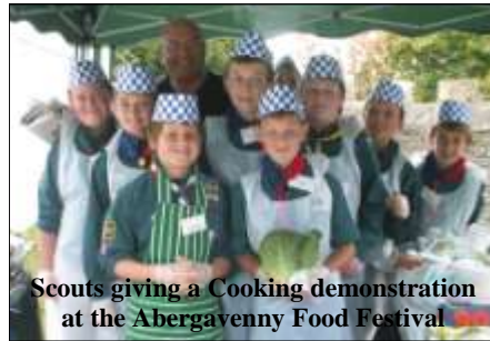
Scouts giving a Cooking demonstration at the Abergavenny Food Festival

Join the Adventure and have fun! E-mail: admin@scoutswales.org.uk Website: www.Scoutswales.org.uk Telephone: 01446 795277